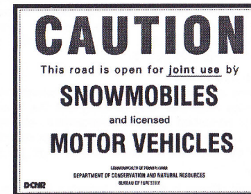
State Forest Roads

State forest and state park roads that are designated as joint-use roads are posted with a CAUTION sign like the sample shown below. Persons from age 10 through 15 may ride on these designated state forest and state park roads only if they hold a valid safety-training certificate issued or approved by DCNR and are under the direct supervision of a person 18 years of age or older.